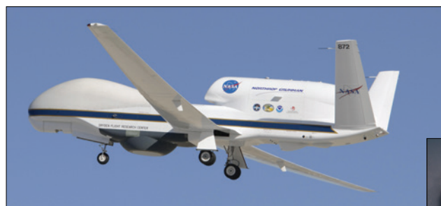
NASA's Global Hawk carrying a synthetic aperture radar payload (inset) on a fully unmanned aerial recon mission uses internal DSP-1750 gyros from KVH to maintain focused and stable imagery.

KVH is the only U.S. FOG manufacturer that draws its own optical fiber, ensuring consistent quality, performance, and instant turn-on to turn-on repeatability in every FOG. And like all of KVH's precision FOGs, the solid state DSP-1750 is built using KVH's patented Digital Signal Processing (DSP) electronics design which offers significant improvements in such critical areas as scale factor and bias stability, scale factor non-linearity, and maximum input rate.